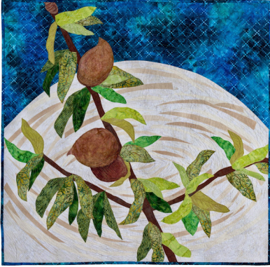
Mother Nature's Milk