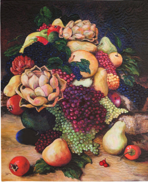
Artichokes and Friends 45" x 36"