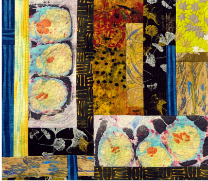
Sushi Q 29" x 33"