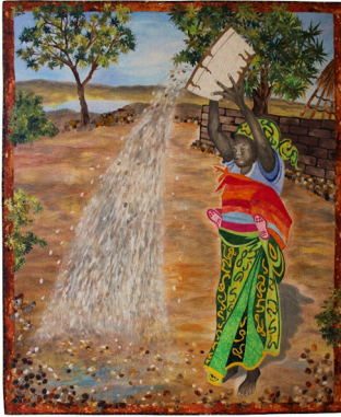
Kwasini Sifting Beans