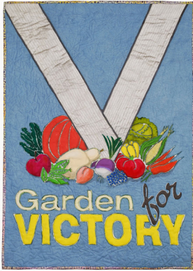
Garden for Victory 35.5" x 25.5"