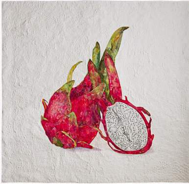
Queen of the Night 42" x 41"