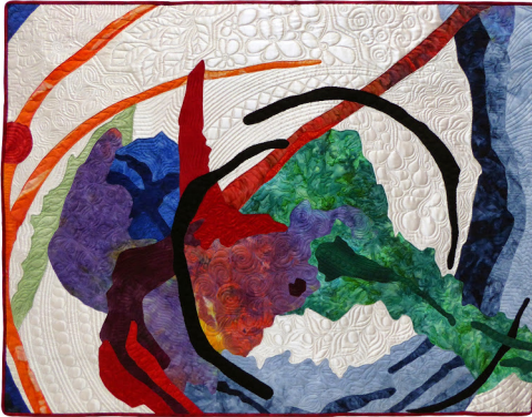
Vege Peels Circling the Drain 29" x 37.5"