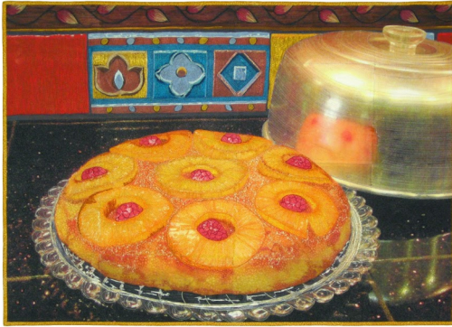
Yum!, Pineapple Upside Down Cake 25" x 35'