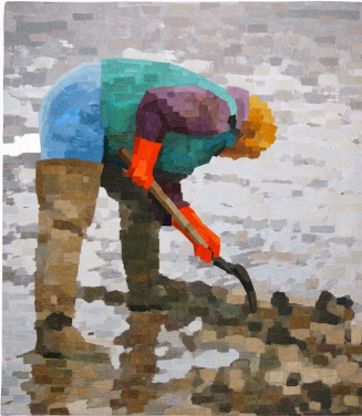
Clam Chowder: Step 1 39.5" x 34.5"